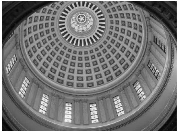
The inside of the new Capitol dome.