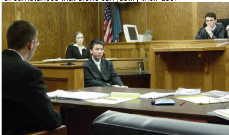
Witness testifies during court proceedings.

Independent review outside of the executive branch is essential if the court is to be assured that cases are designed to push guilt and are limited to extraordinary circumstances that alone can justify their use.